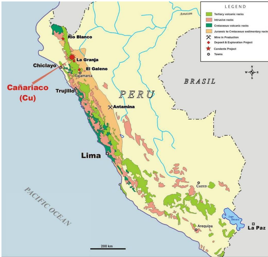
Cañariaco Copper Project Location Map